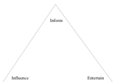
The triangle: Inform, Influence, Entertain Where is what you have just said on it? Mark it with a great big X. Is that where you wanted it to be?

Finally, having sorted out inform, influence and entertain, think about the balance between them just before every time you open your mouth, then make a real effort to get it right. You will be amazed at the results when you do.